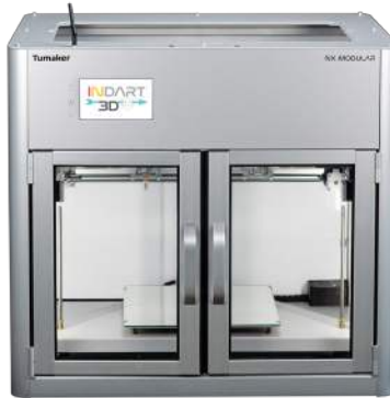
Independent double extruder