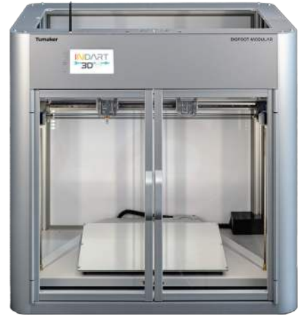
Independent double extruder